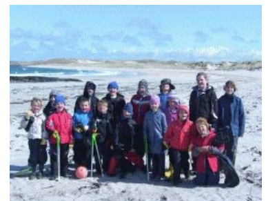
Above – Aringour Primary (Coll)

An eggcase hunt where classes go to a beach to look for eggcases and then identify them back in the classroom. This information can be used to identify which species are breeding in local areas.