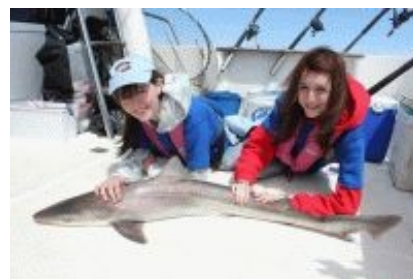
A few photos from Sharkatag to try and give a flavour of the event

more can be found at www.tagsharks.com/tagging-programmes/sharkatag-2010-photo-call