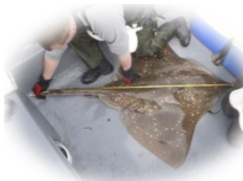
Measure up !

Regional media, Visit Scotland, local officials and the economist Alan Radford were on board our press boat to witness first hand the conservation efforts of the volunteer anglers.