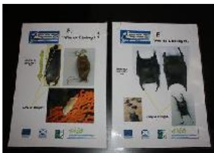
Fig 3; Eggcase ID posters used in Mull school event for Treasure hunt games.

Due to the popularity of the educational visits, the educational pack has been updated throughout phase two, and will soon be available on the SSTP website, www.tagsharks.com/reading-room-2 for teachers to download for in-house lessons and activities.