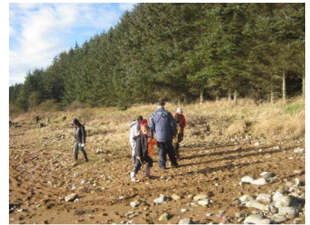
Fig 1; pupils from primary in Dumfries on an eggcase hunt with project officer Lewis Cowie

341 children from 19 schools, participated in the educational visits which included a short presentation on sharks, marine and outdoor activities, including eggcase hunts, rock pooling, beach cleaning (in Association with the GrabTrust Argyll) and educational games; SNH life size boardgame and the SSTP shark-o-metres.