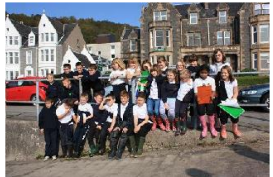
Fig 2; Pupils from Park Primary, Oban after a beach clean/eggcase hunt, in collaboration with the Grab Trust